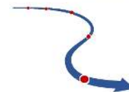
(6) RTS continuum