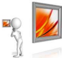
(4) Narrow view of RTS readiness after ACL reconstruction