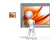
(8) Big picture view