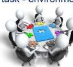
(7) Shared decision