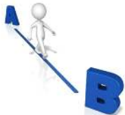
(3) A yes or no RTS decision only at the hypothetical "end" of the rehabilitation