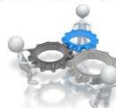
(5) Interaction individual - task - environment