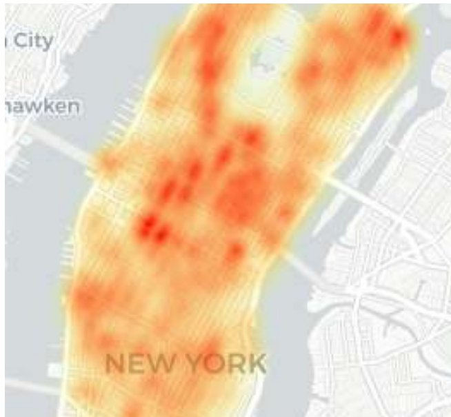
Fig. 1: A cropped view of the initial vehicle distributed needed to service all of the taxi demand in Manhattan for a particular day

In what follows, we address the problem of determining how many vehicles are needed and where they should be for a MoD fleet to service all the taxi demand at city-scale with a maximum waiting time and maximum incurred delay while allowing multiple requests to be serviced by the same vehicle. We show that optimizing the number of vehicles and their distribution, we can significantly improve the efficiency of a MoD fleet.