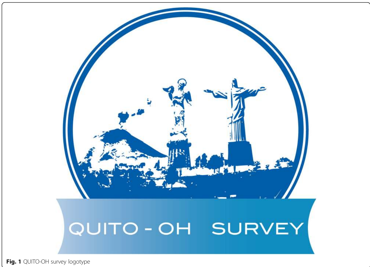
Fig. 1 QUITO-OH survey logotype

the urban area, with approximately 134,000 students and about 17,000 aged 12 years.