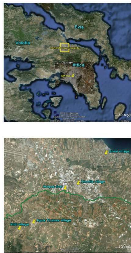
Figure 1 Map of the Oinofita municipality (study area) in Greece. Panel A: Oinofita municipality lies at the border of the Voiotia with the Attica prefecture. Panel B: Oinofita municipality is comprised of four villages: Klidi, Agios Thomas, Oinofita and Dilesi. The high industrial concentration near Asopos river can also be observed.

Initial concerns were raised after Oinofita area citizens complained about the discoloration and turbidity of their