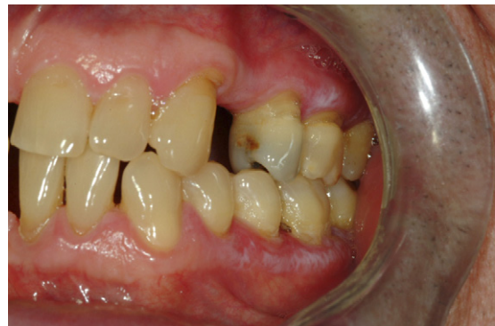
Fig. 6. Gingival lichen planus.