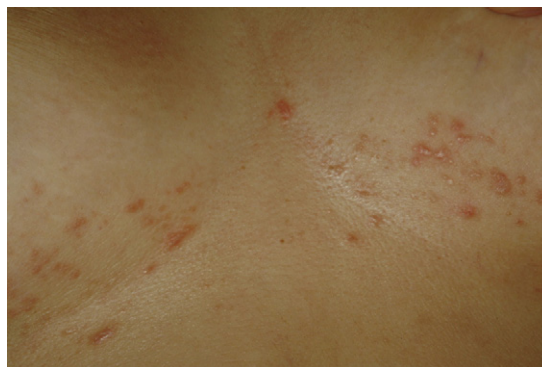
Fig. 7. Cutaneous lichen planus.

LP on the scalp can cause scarring alopecia, lichen planopilaris. LP may also affect the nails where it produces thinning and ridging of the nail plate, and splitting of the distal free edge of the nail.