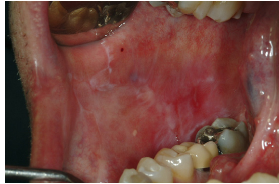
Fig. 4. Atrophic lichen planus.

The most common sites affected are the buccal mucosae, tongue (mainly the dorsum), gingiva, labial mucosa, and vermillion of the lower lip. 18,2 About 10% of patients with OLP have the disease confined to the gingiva (Fig. 6). 19 Erythematous lesions that affect the gingiva cause desquamative gingivitis, the most common type of gingival LP, 20 which can also present as small, raised, white, lacy papules or plaques,