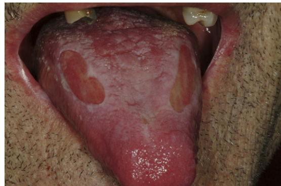
Fig. 5. Erosive lichen planus.