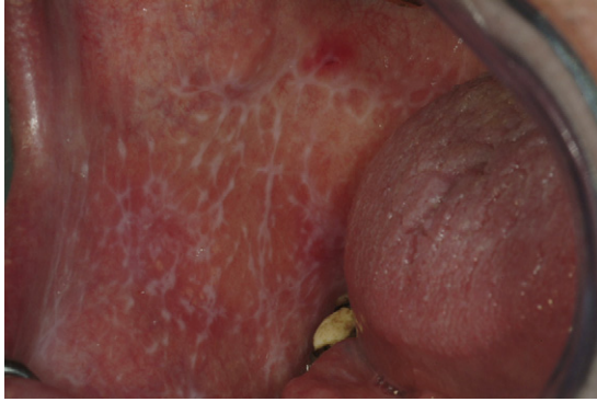
Fig. 1. Reticular lichen planus in the most common site, the buccal mucosa.