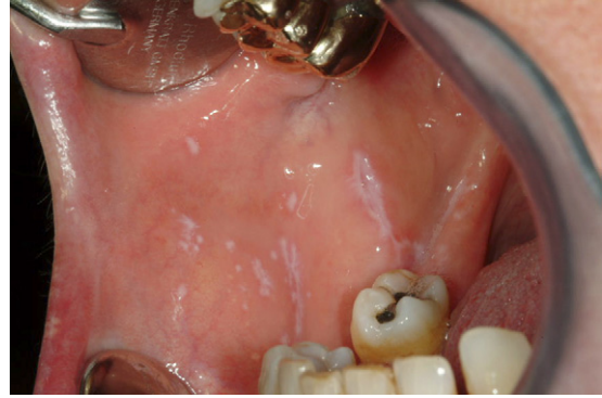
Fig. 3. Papular lichen planus.

controlled studies, the proportion of people infected with HCV was higher in the LP group than in controls in 20 of the 25 studies, and patients with LP had about a five-fold greater risk of being infected with HCV than controls. 15 However, this appears not to be the case in the UK or northern Europe.