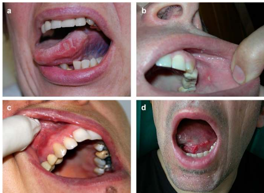
Fig. 2 Representative images of mucositis induced by target therapies. (a-b) patchy ulcerations (aphthous ulcerations) induced by cetuximab, (c) erythema of the mucosa induced by temsirolimus and (d) ulcerations bleeding with minor trauma induced by everolimus

The epidermal growth factor (EGFR) inhibitors-associated mucosal lesions occur in 15% of treated patients [35]. Clinically they appear as limited lesions characterized by a moderate erythema, sometimes non dissimilar to an aphthous like lesions [36] (Fig. 2). As for mIAS, the onset is concomitant with the first cycle of treatment, may potentially affect all the non-keratinized area and can resolve autonomously during treatment [36]. Less than 1% of patients treated in mono-therapy