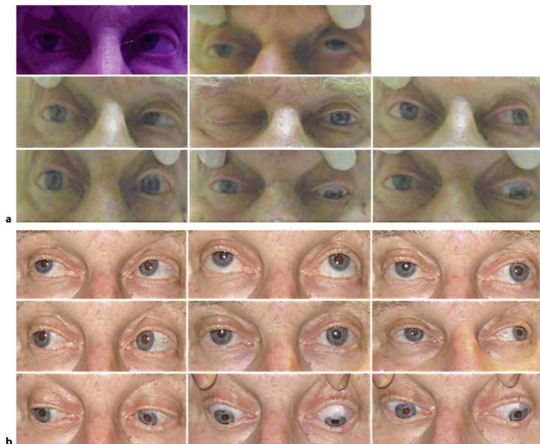
Fig. 1. a Extraocular movements prior to treatment, demonstrating an orbital apex syndrome. b Eye movements after 2 weeks of voriconazole therapy.