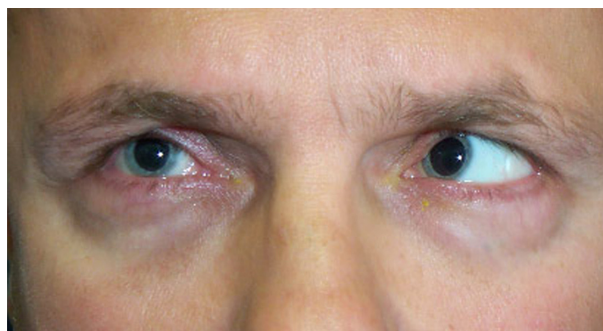
Figure 2 A patient with a right medial orbital wall fracture and medial rectus entrapment demonstrates restriction of abduction of the right eye.

Muscle attachments along the zygomatic arch include the origin of the masseter, the zygomaticus major, and some fibers of the temporalis fascia. It is vital to limit subperiosteal dissection during repair in order to maintain the bony connections of the muscles of facial animation. Whitnall's tubercle, which serves a critical role in the maintenance of eyelid contour as the attachment site for the lateral canthal tendon, is located on the zygomatic bone, 2 mm behind the lateral orbital rim. 4