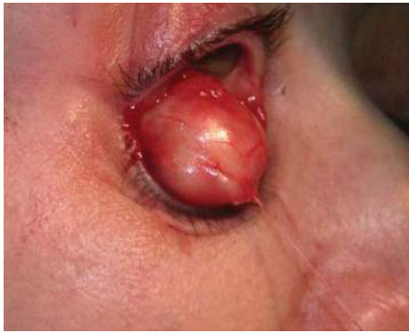
FIGURE 3: Right sided 28 mm schwannoma expressed through anterior traction by the whip suture.