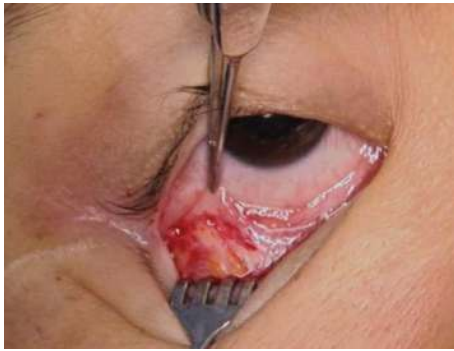
FIGURE 2: Initial inferior fornix conjunctival incision.

of California, Los Angeles approved the study protocol, and the tenets of the Declaration of Helsinki were followed.