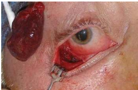
FIGURE 4: Exsanguinated right sided 34 mm cavernous hemangioma after removal through conjunctival incision under local anesthesia.

any bleeding vessels are controlled with bipolar cautery (Figure 4).