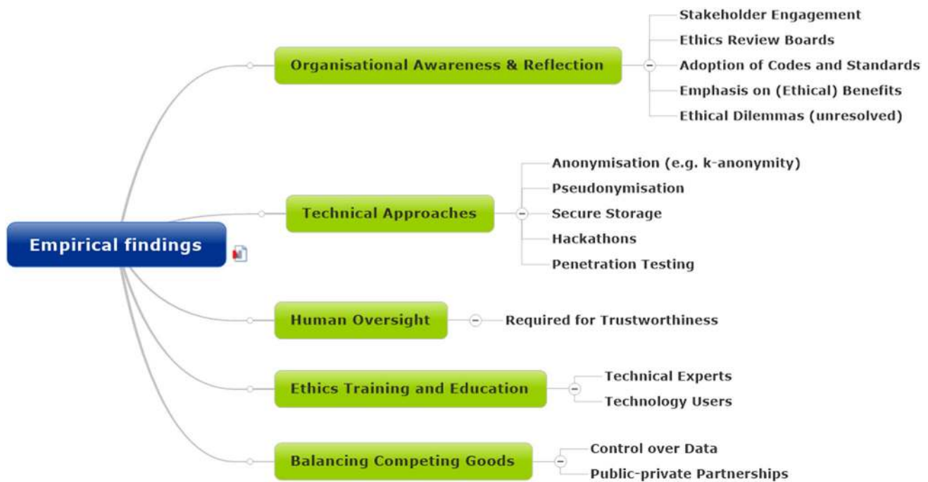
Fig. 3 Mitigation strategies employed in case studies

about data collection, data manipulation, and computational aspects of AI applications (CS10). Software designers must incorporate the necessary reliability aspects and consequently redesign the software to ensure their inclusion (CS01). However, people with such skill sets are rarely trained in ethical analysis. This was especially apparent in CS01, CS08 and CS09, where all of the interviewees were technology experts and had no background in the study of ethics but were acutely aware of privacy concerns in AI use.