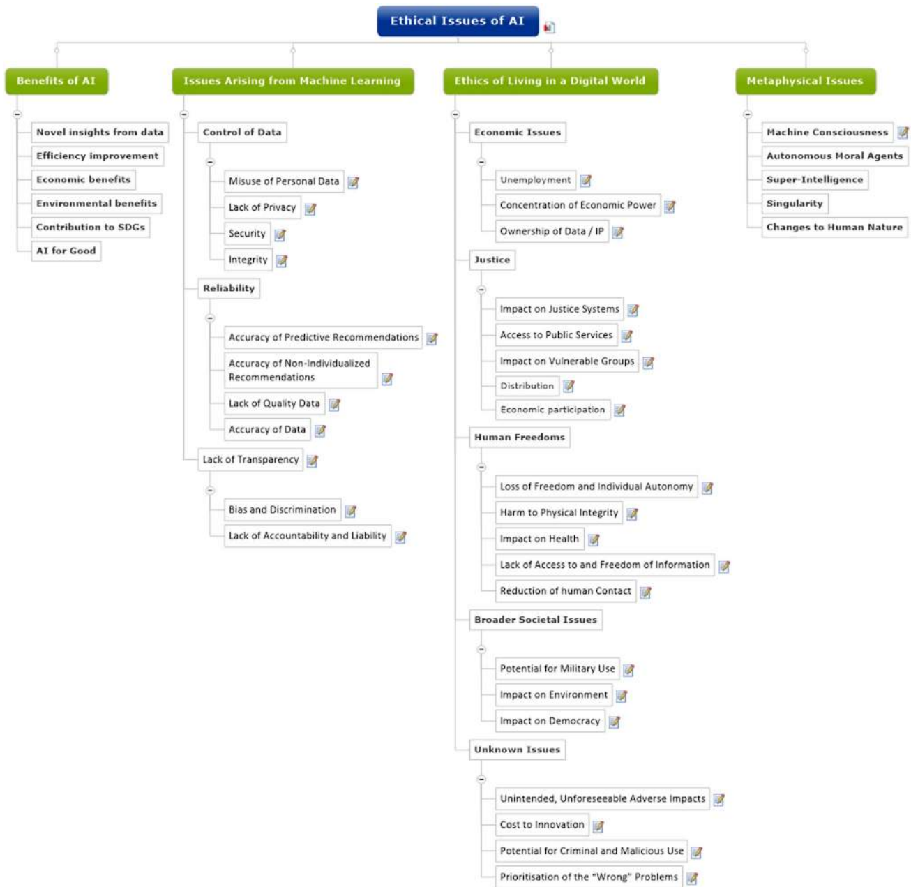
Fig. 1 Ethical issues of AI

as well as supporting areas of the economy other than just the AI sector (European Commission 2020). Such efficiency gains can have immediate effects by reducing environmental damage arising from inefficient production.