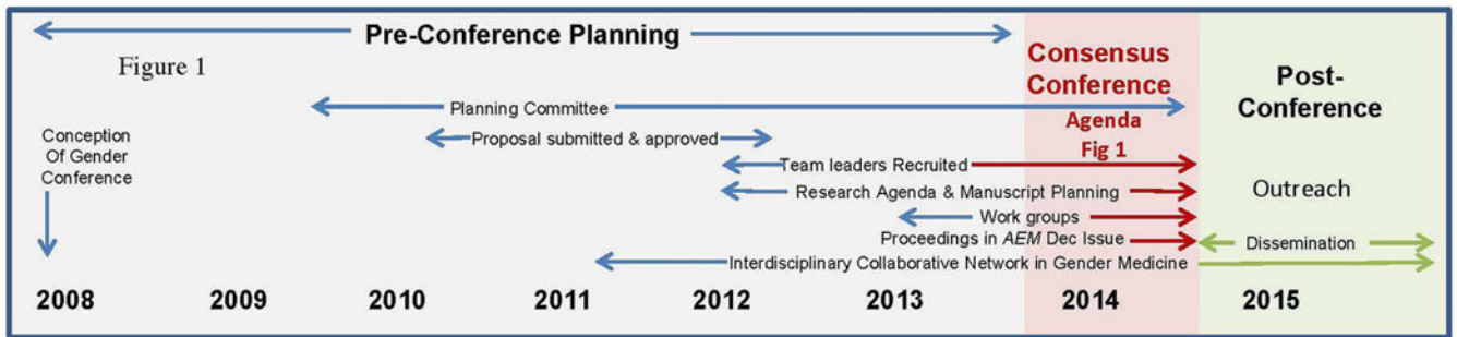
Figure 1. Timeline for the 2014 AEM consensus conference: planning, execution and dissemination.