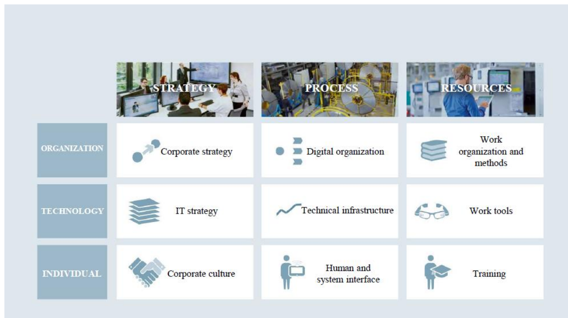
Figure 2. A model for designing digitized working environments at BMW

BMW AG is the parent company of the BMW Group, a globally operating German car and motorcycle manufacturer based in Munchen. The product range includes the automobile and motorcycle brand BMW, the car brands Mini and Rolls-Royce as well as the BMW sub-brands BMW M and BMW i. With its anniversary of 100 years of existence and the beginning of the digital age, BMW decided in 2016 to improve its organizational performance. In this respect, the company concentrated its efforts on three main issues (BMW Group, 2018a): strategy, process and resources (Figure 2).