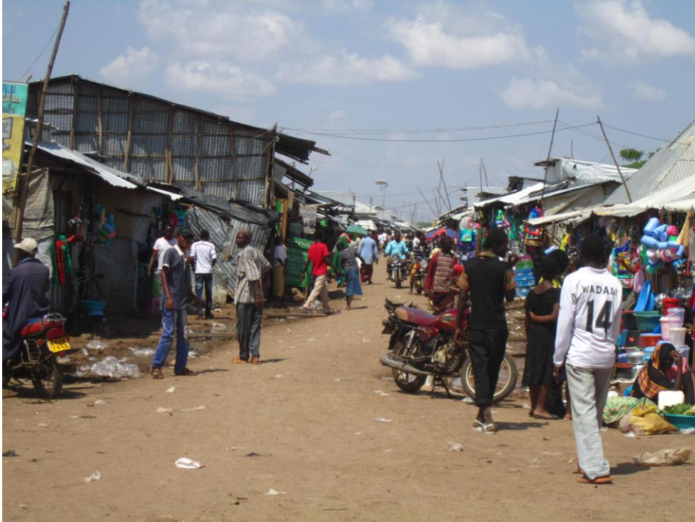
PHOTO 2 Recently established section of the Dadaab refugee camp