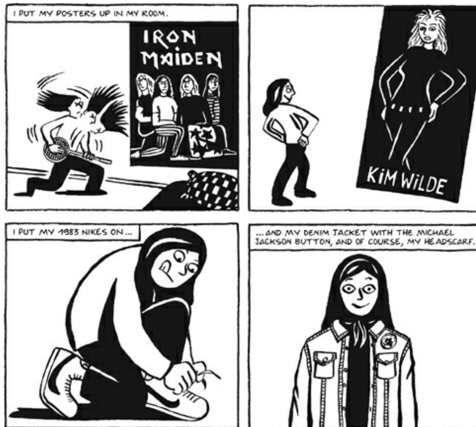
Figure 4 ( Persepolis 131)