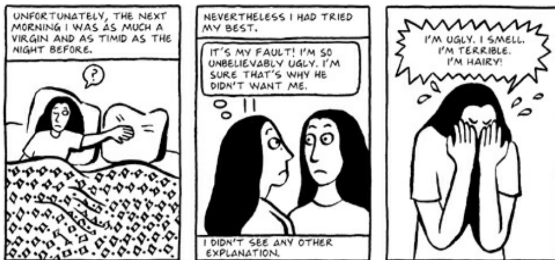
Figure 5 ( Persepolis 2 59)

In addition to the resemblance to the first and second waves of Western feminism, Persepolis and Persepolis 2 can also be related to Spivak's image about "the 'third-world woman' caught between tradition and modernization" (306). The main character of both graphic novels represents a modern Iranian woman who, despite liking Western pop music, Marxist ideology, democracy and women's freedom; does not separate from her cultural roots. Her family and ancestors, for instance, are transcendental in her life. This can be observed in Satrapi's happiness