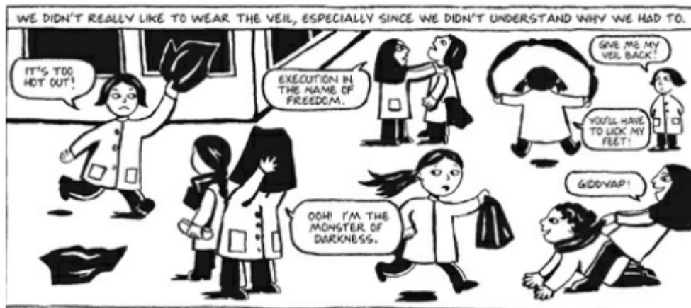
Figure 9 ( Persepolis 3 )

because she was diabetic ( Persepolis 108-110). Satrapi, thus, reveals diverse identities and forms of conceiving Iran, where many people are not submissive or aligned to the imagined nation imposed by the regime. Instead, they reject Iranian Government and look for different ways to cheat, repel and evade it, contradicting the Orientalized stereotype about the submission and passivity to dictators and religious extremists in the Middle East.