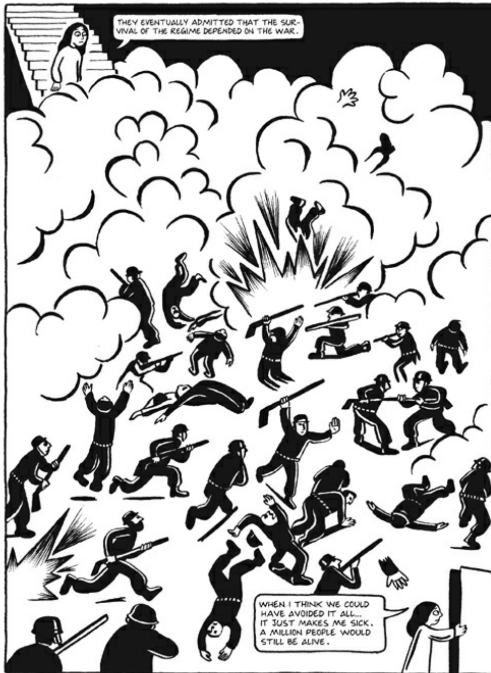
Figure 10 ( Persepolis 116)