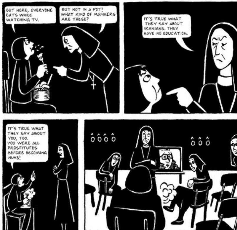
Figure 7 ( Persepolis 2 , 23)

Austria and suffers serious consequences for it. This can be clearly observed in the chapter called “Pasta” of Persepolis 2 . In this episode, she lives in a residence of Christian nuns and watches television in the living room, while eats from a pot full of pasta. Then, the superior nun reproaches her saying: “What kind of manners are these... It’s true what they say about Iranians. They have no education” (23) (Figure 7). It can be seen how the nun uses the binary division of civilization-barbarism to establish that Austrians (and, thus, Westerners) are civilized people,