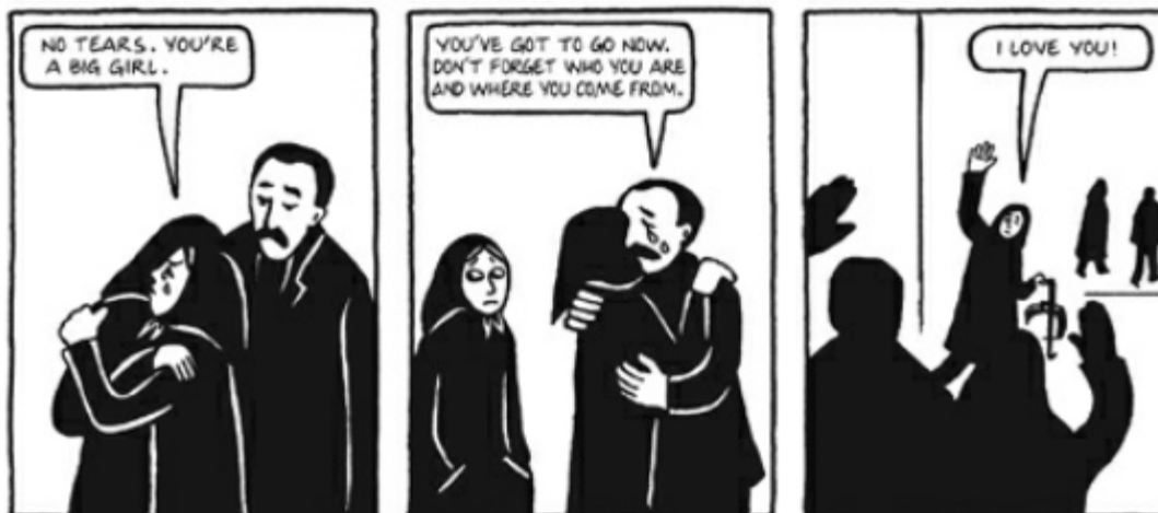
Figure 6 ( Persepolis 152)

when she knows that her grandfather was a prince who was later overthrown, confiscated and imprisoned (22-24); and in her family sadness when she leaves her home to study in Vienna (152) (Figure 6). In fact, her father tells her, “Don’t forget who you are and where you come from” (152). The protagonist fits then in Spivak’s argument because she is between her family—which represents her country and native culture—and the West cultures, values and feminism.