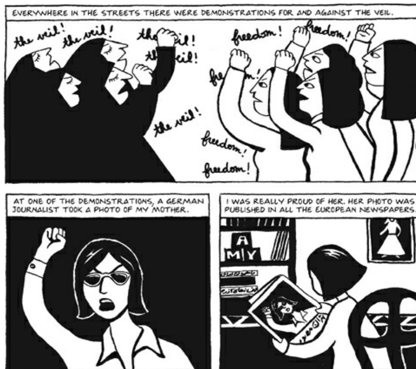
Figure 3 ( Persepolis 5)

Nevertheless, going back to the second question and Spivak's quote, the insurgence of Iranian women in Satrapi's work can be seen as a Western imperialist notion that creates the illusion of female freedom in Eastern women, in order to make them defenders of the Occidental