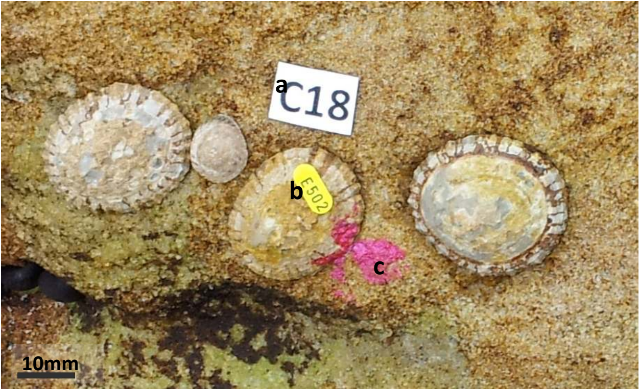
Figure S1. Limpet labelled with a) Waterproof paper, b) shellfish tag and c) nail enamel