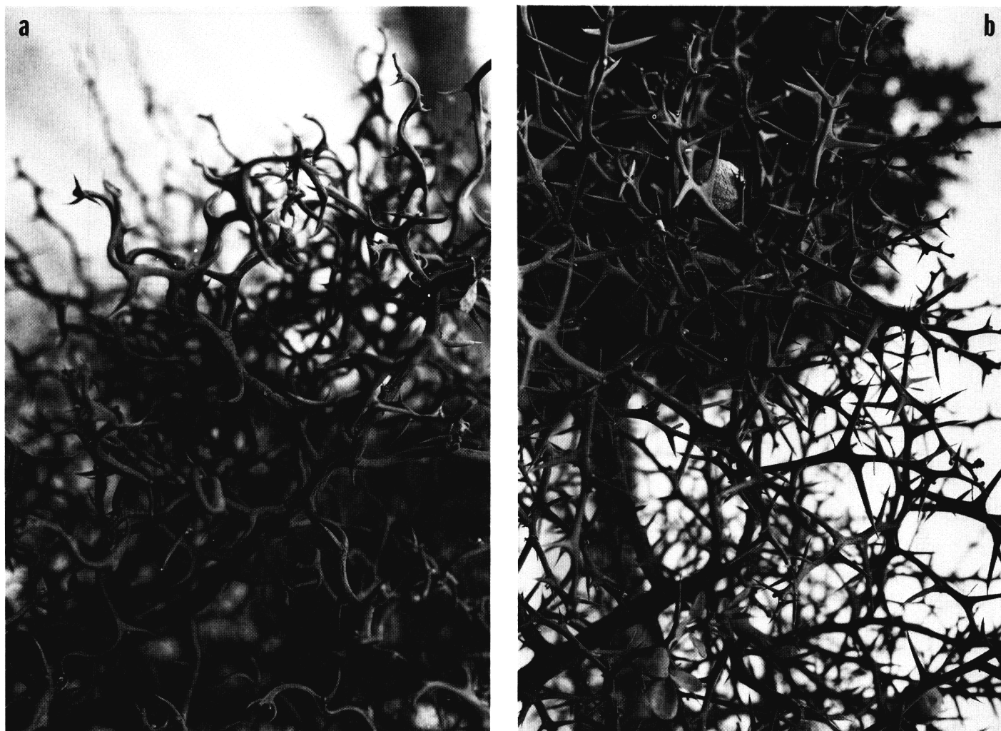
Fig. 2. Progeny trees of self-pollinated 'Flying Dragon' trifoliolate orange showing (a) curved thorn and trunk and (b) straight thorn and trunk.

‡ Mean separation by LSD test using P < 0.05 .