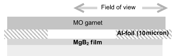
Fig. 2. Schematic of sample configuration where two pieces of Al-foil is placed between the \text{MgB}_2 film and the garnet indicator. The space above the central part of the \text{MgB}_2 film is empty. The MO indicator is in this way placed with a constant distance from the superconductor, ensuring good conditions for the imaging.

Shown in Fig. 1 are two MO images of the flux penetration in magnetic fields of 8 and 14 mT applied perpendicular to the film. These measurements were carried out at 3.6 K, and the characteristic dendritic patterns are clearly visible. The sweeping rate of the applied field was slow, of the order of 1 mT/s. Nevertheless, the growth of the dendritic structures proceeds extremely fast, where each tree-like structure is formed during less than 1 ms (the time resolution of our CCD camera system). However, once formed, each dendrite appears frozen and does not gain more flux as the applied field increases and other dendrites appear. This is contrary to the typical penetration observed in absence of dendrites, where the penetration is gradual with increasing field. The dendrites formed at the larger applied fields are seen to be brighter, i.e., they contain more flux than the ones formed at a lower field.