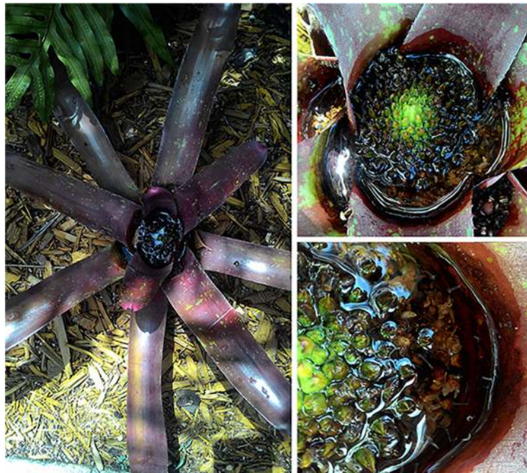
Fig. 2 Ornamental bromeliads breeding vector mosquitoes