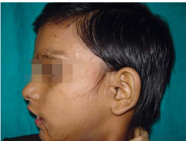
Fig. 3: Extraoral photograph—Left view of patient's face