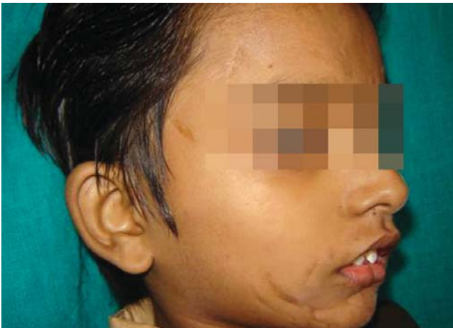
Fig. 2: Extraoral photograph—Right view of patient's face