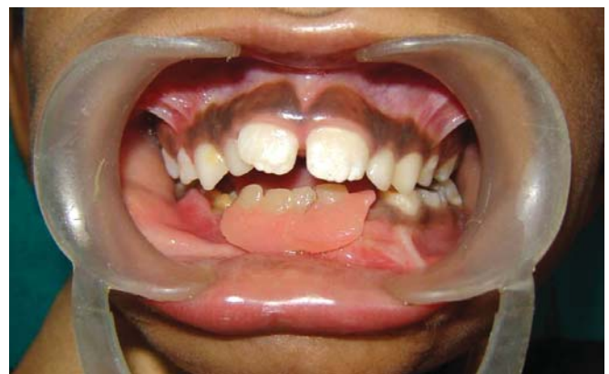
Fig. 6: Removable partial denture in position

treatment, without any apparent emotional or psychological side effects. Treatment undertaken was directed towards maintaining arch length integrity, restoring aesthetics and avoidance of future speech defects. A polysiloxane (putty) impression was made of the upper and lower arches and models poured in dental stone. Following this, an acrylic removable partial denture was constructed and delivered (Fig. 6). The patient was recalled in a month's time for review.