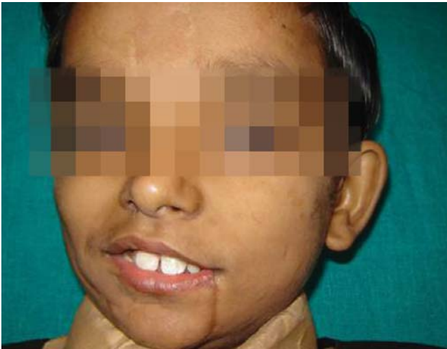
Fig. 1: Extraoral photograph—Front view of patient's face