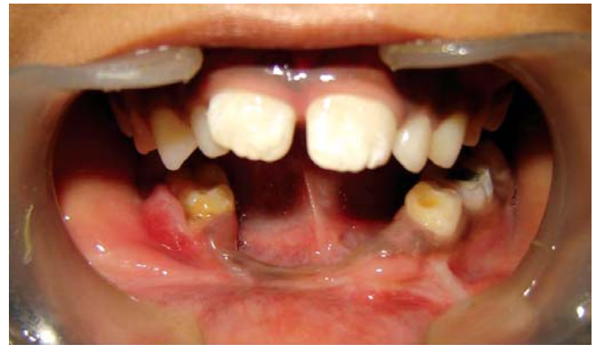
Fig. 4: Intraoral photograph