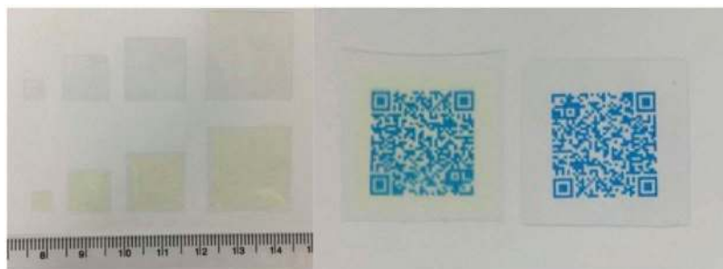
Figure 3. Examples of oromucosal films prepared with printing techniques (left: SSE printed warfarin films (transparent films) and inkjet printed substrates (yellow colorant in warfarin ink), right: QR code printed on substrates (blue placebo ink)).

3D printing, also called additive manufacturing, is associated with great flexibility regarding the size, geometry, and inner