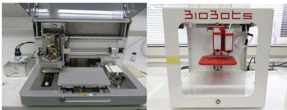
Figure 2. Examples of printers used for pharmaceutical manufacturing (left: piezoelectric inkjet printer PixDro LP 50, right: a dual syringe BioBots (Allevi) semi-solid extrusion (SSE) printer).

Oromucosal films can be prepared by inkjet printing non-continuously for small batches (e.g. community or hospital