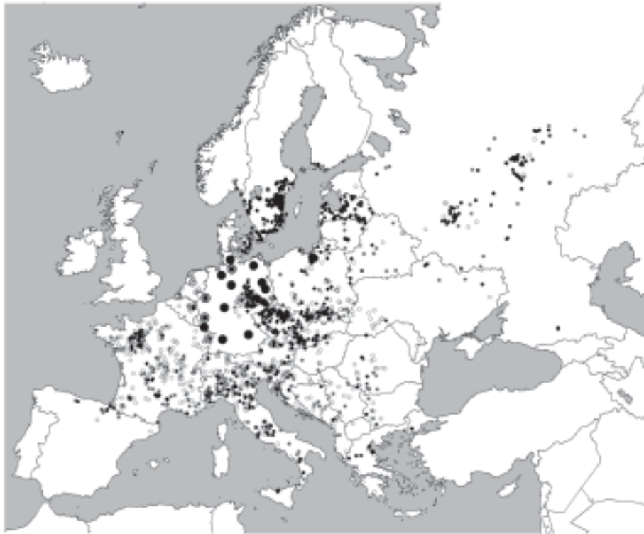
Fig. 4. Distribution of Osmoderma eremita in Europe: ○. Last record before 1950, or the time unknown; ◐. Last record 1950–1989; ●. Last record in 1990 or later. Larger circles represent records in German federal states where we do not have data for the individual localities.

Fig. 4. Distribución de Osmoderma eremita en Europa: ○. Último registro anterior a 1950, o fecha desconocida; ◐. Último registro entre 1950 y 1989; ●. Último registro de 1990 o posterior. Los círculos más grandes representan registros en Alemania Federal de donde no disponemos de datos de localidades por separado.