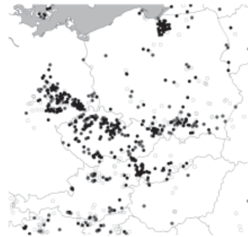
Fig. 6. Distribution of Osmoderma eremita in Eastern Germany, Poland, Czechia, Slovakia, Austria and Hungary: ○. Last record before 1950, or the time unknown; ◐. Last record 1950–1989; ●. Last record in 1990 or later.

pasture landscapes and parks, free-standing trees have become scarcer for several reasons, for instance due to ceased removal of underwood (Vera, 2000). On agricultural fields and in alleys trees have been removed. Besides, a wide relinquishing of old fruit plantations has led to a massive lost of suitable habitats in Western Germany (Stegner, 2002). A problem, which today is mainly "eastern", is the loss of large trees due to the development of housing and trade areas and new highways (Saxony: Lorenz, 2001; Schaffrath, 2003b). For instance, many trees with O. eremita were lost due to the building of an automobile factory in Dresden.