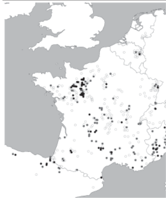
Fig. 8. Distribution of Osmoderma eremita in The Netherlands, Belgium, France and Spain: ○. Last record before 1950, or the time unknown; ⊙. Last record 1950–1989; ●. Last record in 1990 or later.

Fig. 7. Distribución de Osmoderma eremita en Bielorrusia, Rusia y Ucrania: ○. Último registro anterior a 1950, o fecha desconocida; ⊙. Último registro entre 1950 y 1989; ●. Último registro de 1990 o posterior.