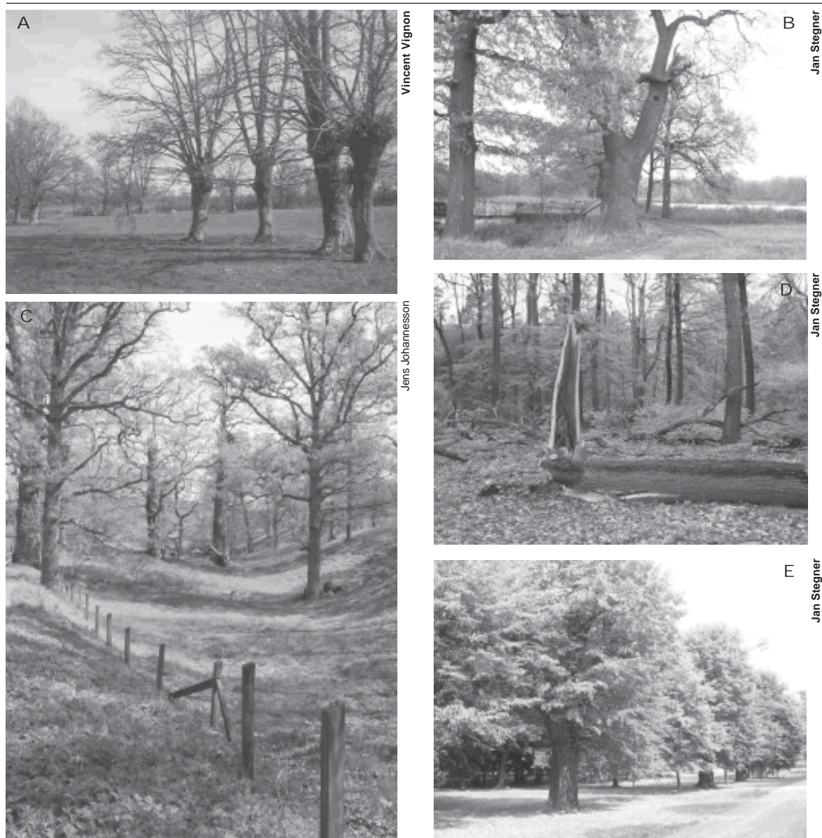
Fig. 1. Typical trees harbouring Osmoderma eremita for different parts of Europe: A. Pollarded oaks in hedgerows in western France; B. Oaks in a historical pond-region in Eastern Germany; C. Pastured oak-land in southern Sweden; D. Beech forest in Germany, the tree harboured O. eremita before it was storm-felled; E. An alley with willow trees in a park in Germany.

Fig. 1. Árboles típicos que cobijan a Osmoderma eremita de distintas partes de Europa: A. Robles desmochados en zonas de setos en el oeste de Francia; B. Robles en una región con charcas de Alemania del Este; C. Tierras de pastoreo con robles en el sur de Suecia; D. Hayedo de Alemania, el árbol cobijaba a O. eremita antes de que fuera cortado por una tormenta; E. Un paseo con sauces en un parque de Alemania.