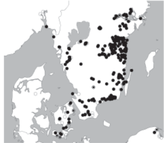
Fig. 10. Distribution of Osmoderma eremita in Norway, Denmark and Sweden: ○. Last record before 1950, or the time unknown; ◐. Last record 1950–1989; ●. Last record in 1990 or later.

habitats today and is extinct in some areas (Szwalko, 1992b). The species is included in local and national red lists (Szwalko, 1992b; Pawłowski et al., 2002). Old trees have been removed in managed forests, along roads and in urban areas, regarded as a source of "pests and pathogenic fungi" or a danger for humans and vehicles. Many monumental trees, which are specially protected by law, have been "cured" by mechanical cleaning of the hollows and impregnating of the wood surface with pesticides (Szwalko, 1992a). Such methods of "conservation" have been restricted due to Polish implementation of the Bern Convention and EU's Habitat Directive. New forest management methods promote preservation of some old, especially hollow, trees wherever possible. Localities where the species still exists have already been or will be protected under the recently started NATURA 2000. On the other hand, in many managed forests (including some forest