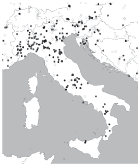
Fig. 9. Distribution of Osmoderma eremita in Switzerland, Italy, Slovenia, Croatia and Bosnia–Herzegovina: ○. Last record before 1950, or the time unknown; ◐. Last record 1950–1989; ●. Last record in 1990 or later.