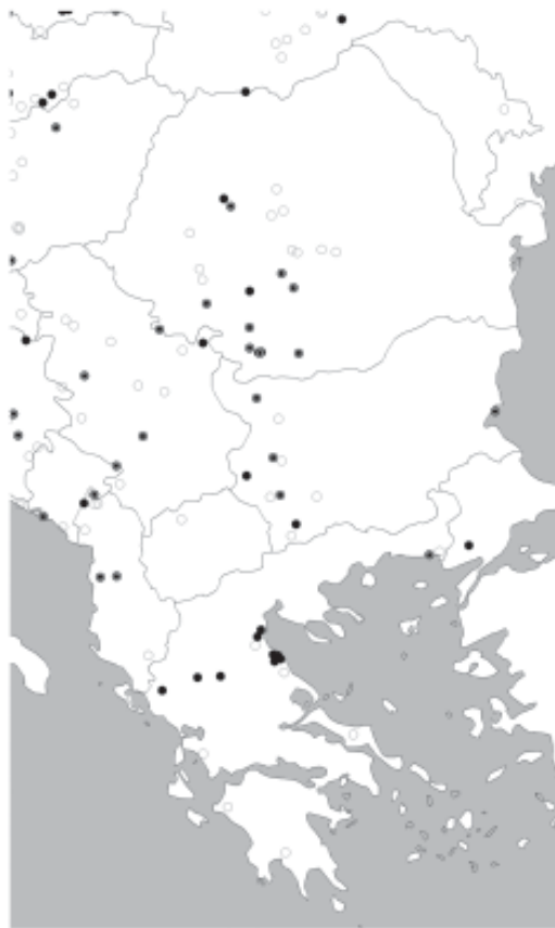
Fig. 5. Distribution of Osmoderma eremita in Serbia, Montenegro, Macedonia, Albania, Greece, Rumania, Moldova and Bulgaria: ○. Last record before 1950, or the time unknown; ◐. Last record 1950–1989; ●. Last record in 1990 or later.