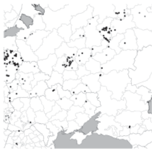
Fig. 7. Distribution of Osmoderma eremita in Belarus, Russia and Ukraine: ○. Last record before 1950, or the time unknown; ⊙. Last record 1950–1989; ●. Last record in 1990 or later.

Fig. 7. Distribución de Osmoderma eremita en Bielorrusia, Rusia y Ucrania: ○. Último registro anterior a 1950, o fecha desconocida; ⊙. Último registro entre 1950 y 1989; ●. Último registro de 1990 o posterior.