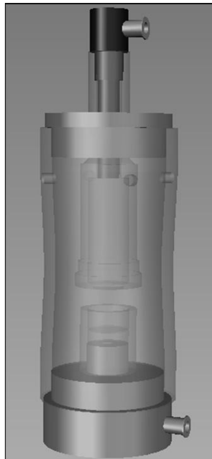
Fig. (1). Compression bioreactor for cyclic loading of the constructs under sterile culture conditions.