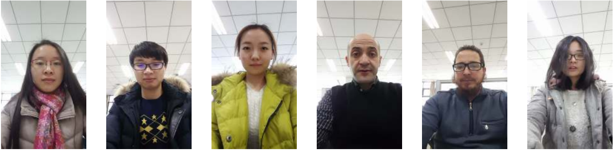
Fig. 1: Samples of the subjects recorded in the database.

to be valuable tools for the community, more challenging datasets are needed to reach the next level and solve some fundamental generalization related problems in face PAD.