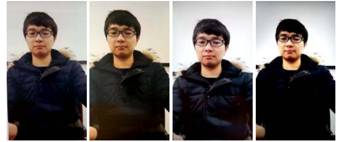
(a) Print 1 (b) Print 2 (c) Replay 1 (d) Replay 2