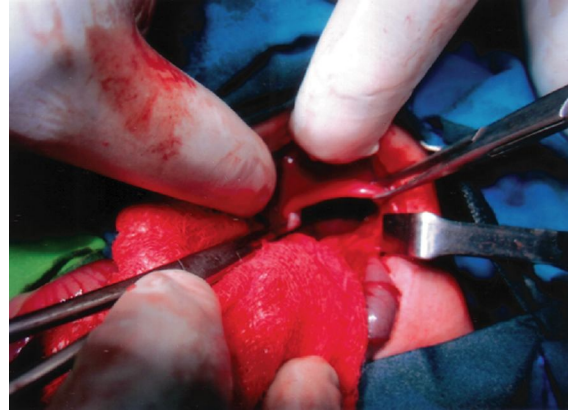
Fig-3. Per-operative view of defect in left dome of diaphragm

Postoperative X-ray showed good lung expansion, correction of mediastinal shifting and no evidence of any pleural effusion. All study cases (n=12) of CDH survived. So survival rate was 100%. No wound complication was reported. During follow-up weight gaining was smooth and uneventful.