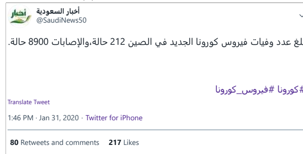
(a) Tweet with a True claim

أخبار السعودية @SaudiNews50 Follow حساب أخبار السعودية على تويتر، متابعة أهم الأخبار، أخبار عاجلة وحصرية . للتواصل: s@saudinews50.info واتساب 00966500360610