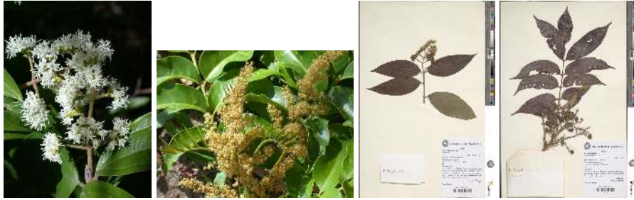
Fig. 1. Photos in the field and herbarium sheets of the same individual plant ( Tapirira guianensis Aubl.). Despite the very different visual appearances between the two types of images, similar structure and shapes of flowers, fruits and leaves can be observed.

remaining herbarium sheets come from the iDigBio 5 portal (the US National Resource for Advancing Digitization of Biodiversity Collections).