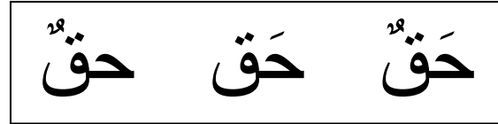
Fig. 1. Different representations of the same word with and without letters' diacritics.

We decided to substitute words with their synonyms manually (no matter it is time-consuming) after many attempts to perform this task automatically. Despite our efforts to obtain exact synonyms by using part of speech tagging and lemmatization, our attempts produced either passages with totally different meanings from the original ones (poor precision) or very few passages with substituted words (poor recall). These unsuccessful attempts could be respectively attributed to: