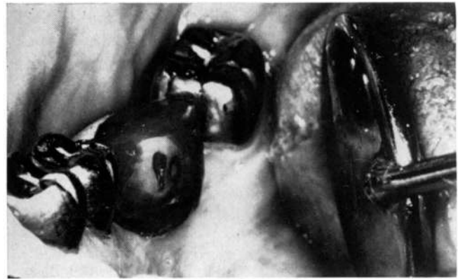
FIGURE 3. Pellet silver-silver chloride electrode and platinum electrode mounted on removable bridge pontic in subject's mouth.

periodontal pockets having gross subgingival calculus. The platinum electrode was inserted into the pockets and a glass miniaturized silver-silver chloride electrode was placed at the opening of the pocket. After the potentials were recorded the pocket depth was measured. Also in all the subjects Eh was measured in a gingival crevice of less than 3 mm depth with no calculus and minimal inflammation.