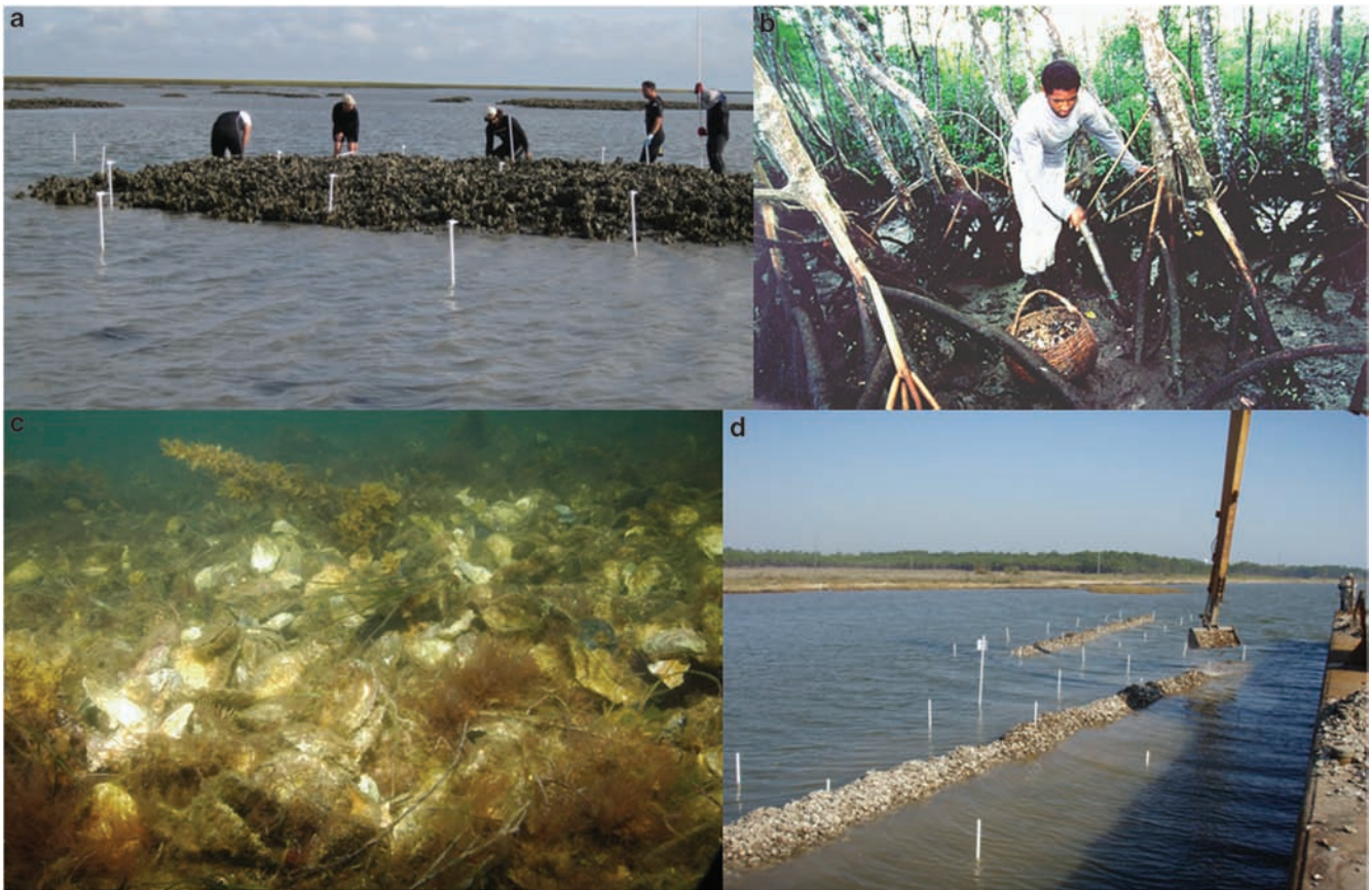
Figure 3. Oyster ecosystem services. (a) Light sensors deployed at low tide to measure filtration and changes in water clarity over a restored oyster reef in Virginia. (b) Oysters being gathered in a mangrove forest in Brazil. (c) Oyster reef restoration in progress to measure shoreline protection in Alabama. (d) Habitat provided by the Australian flat oyster in Tasmania, Australia.

and sport fisheries (e.g., Lipton 2004). Although there is increasing recognition that shellfish provide multiple ecosystem services, management for objectives beyond harvest has not yet become widespread.