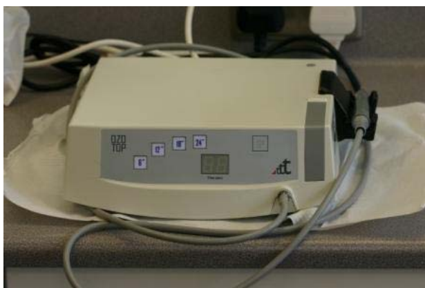
Figure 1. The ozone generator used by the authors.

A literature review revealed little clinical data on the use of gaseous ozone in periodontal disease and conflicting opinions on its benefit [7-10]. Therefore the authors decided to review outcomes from patients under treatment. Recent papers have reported a greater reduction in plaque index, gingival index and bleeding index following the use of ozone irrigation compared to the use of chlorhexidine [14]. Huth et al. [15] similarly showed significant results with gaseous and aqueous ozone and concluded that they merit further investigation. A study by