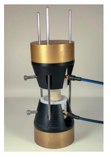
Fig. 1. Two ultrasonic transducers (white) with a polymer sample in between.

The simulation results show that the sensitivity can be increased by a segmented excitation. For this purpose, new ultrasonic transducers with 1-3 piezoelectric composites but structured electrodes were designed [4]. To apply these in the measurement setup and increase sensitivity and reproducibility, further modifications to the measurement setup are presented in this work.