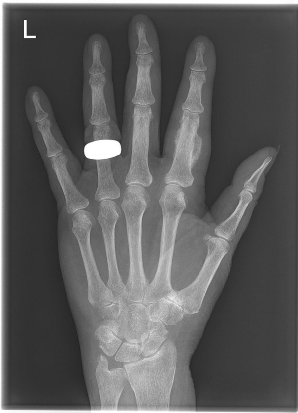
Fig. 1 Radiograph of left hand

swelling of the left index finger of weeks/months duration. The alkaline phosphatase (ALP) was noted to be elevated at 615 u/l (reference range of 30 to 160 u/l). A radiograph was performed of the left hand (Figure 1). In addition, a recent CT Thorax was noted (Figures 2 and 3).