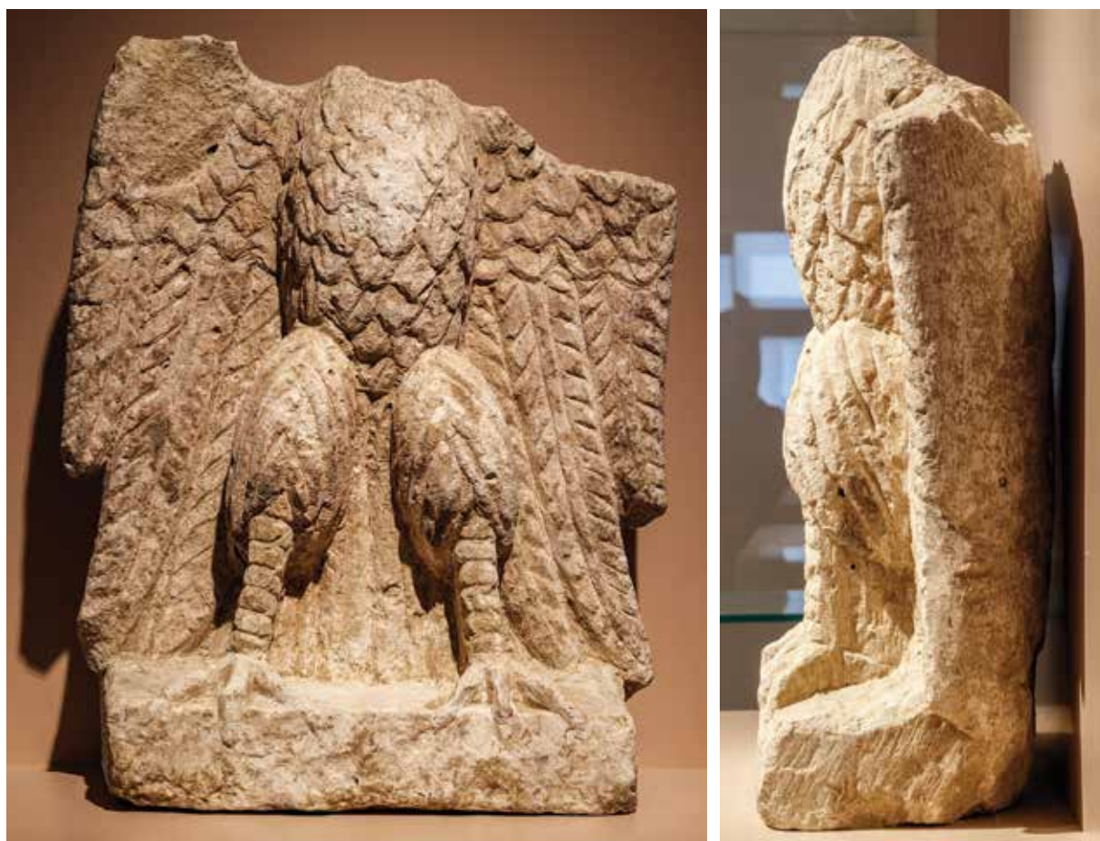
Fig. 3. a: The relief of the eagle from the front (photo: Zs. I. Tóth); 3b: The relief of the eagle from the side (photo: Zs. I. Tóth)