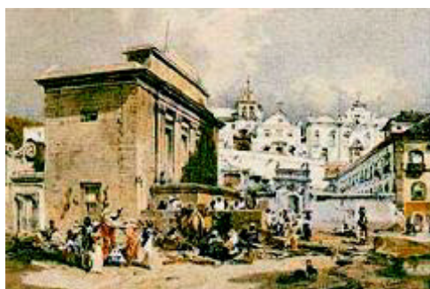
Fig. 1: Third Fountain at Largo da Carioca ; Edward Hildebrand, 1844.