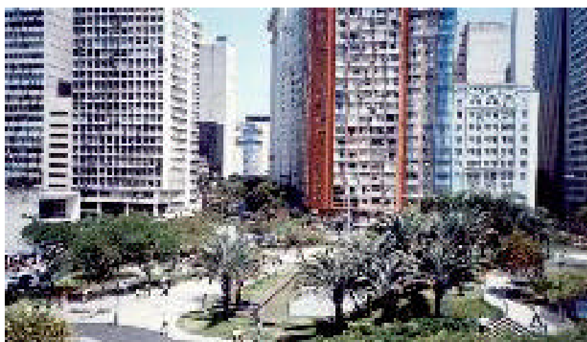
Fig. 3: Largo da Carioca (gardens of Burle Marx), 2003. Ethel Pinheiro.

Since then, Largo da Carioca has remained a place for gatherings and social life, but until recently its physical space was enclosed by the mountains and hills that defined the geography of this area. This restricted any potential expansion of the area and it was only when Mayor Dulcídio Cardoso pulled down Saint Antonio Hill in 1961 and Burle Marx's subsequent intervention in 1980s that we see the open space of Largo da Carioca as it exists today.