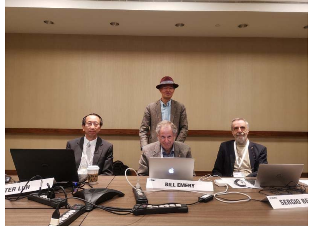
Fig. 1. EiC Fei-Yue Wang (Standing) and The IEEE PRAC Committee on November 21, 2019 at Boston.

This article proposes a novel approach Mythos that detects events and subevents within an event and generates abstract summary and storyline to provide different perspectives for an event. There are three modules in Mythos. Online incremental clustering algorithm identifies small-scale events in the form of small clusters, the event hierarchy generator generates bigger events in the form of hierarchies, and the summarization module produces the summary of events/subevents. The summarization module uses a long short-term memory (LSTM)-based learning model to generate summaries at different levels—from the most abstracted to the most detailed. The summaries at different levels are used to generate a storyline for the event. The experimental analysis on a variety of twitter data sets from different domains compares Mythos against the known existing approaches for event detection and summarization. It outperforms the baseline approaches for both. The generated summaries are evaluated against summaries provided by external reference sources, such as Guardian and Wikipedia.