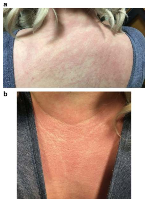
Fig. 1 Clinical features of dermatomyositis with shawl-like rash affecting neck, chest and back. a Flagellate erythema upper back. b ‘V’ neck distribution of erythema

Rheumatology and dermatology review led to the diagnosis of dermatomyositis, likely paraneoplastic, in the context of known metastatic leiomyosarcoma. Investigation supporting this included; raised creatinine kinase (CK) and erythrocyte sediment rate at 695 (normal range 25–200 U/L) and 32 (normal range