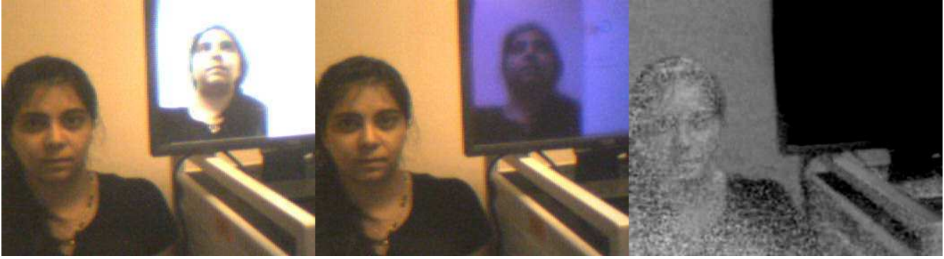
(a) Live face vs. face displayed on an LCD