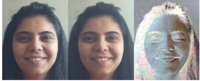
Figure 2. POLARIZATION OF A FACE. Images were obtained by manually rotating a polarizer in front of the camera of a Samsung Galaxy S6 Edge™ smartphone. Left: linear horizontal polarization. Center: linear vertical polarization. Right: PARAPH image I_P from Eq. (3). Under horizontal polarization, the intensity of specularly polarized light is noticeably greater. Note that scaling has been applied for visualization.

To estimate the transmitted radiance sinusoid and analyze the polarization of a surface requires at least three, and often uses four different polarization measurements per pixel. Early work on polarimetric vision mechanically rotated a polarizer between subsequent frames, but rotating fast enough to achieve video rate polarization imaging is complex and hence not cheap; bossanovatech.com sells cameras using computer-controlled rotating polarizers. Alternatively, one can use beam-splitting and multiple cameras, such as in the system commercially available from fluxdata.com , but this too is expensive. An even higher-end approach, available from 4dtechnology.com , is a single high-speed camera with a grid of pixel sized polarizers, precisely aligned to replace the traditional Bayer pattern. Such cameras can support hundreds of frames per second and can work in NIR, but the cost per unit starts at 10,000 and increases to over 25,000 US dollars. A much lower cost “do it yourself” approach for obtaining full polarization imag-