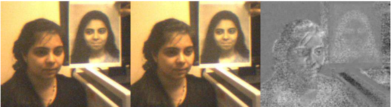
(c) Live face vs. face printed on matte paper

Figure 3. FACES: REAL AND PRESENTATION MEDIA SUBJECT 1. Vertical polarization images (left), horizontal polarization images (center), and PARAPH images (right) are shown for each of the faces. As a function of the vertical polarization of the LCD in (a), we can clearly differentiate this attack even with one polarizer. Note that the intensity of specular reflection on the face is greater for images taken at horizontal polarizations than for vertical polarizations, but as an inherent property of the screen the intensity of the LCD is far greater for vertical polarizations, and thus yields a very low intensity PARAPH image. While the high quality glossy print in (b) may be good enough to spoof facial recognition systems that use conventional cameras, its PARAPH image looks little like a face due to a relatively uniform polarization of the gloss. A high quality printed photo on matte paper has a PARAPH image that traces the silhouette of a face as shown in (c), but is devoid of fine structure. With the cheap webcam that we used, the dark regions of the image have noticeable noise which results in artificially large values for Eq. 3 which leads to the apparent face silhouette. Future work better noise reduction. Note: scaling has been applied for visualization.