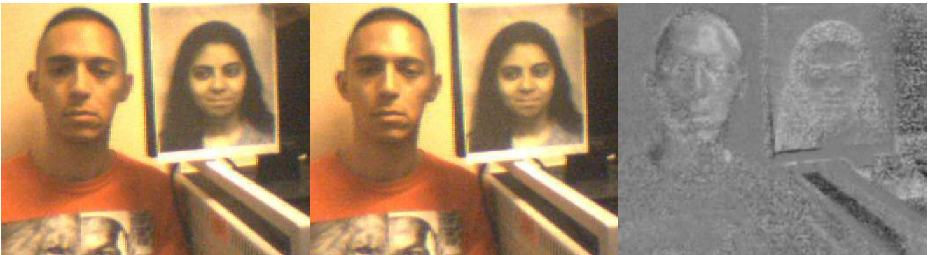
(c) Live face vs. face printed on matte paper