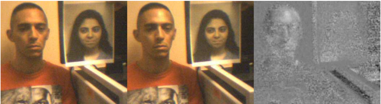
(b) Live face vs. face printed on glossy paper