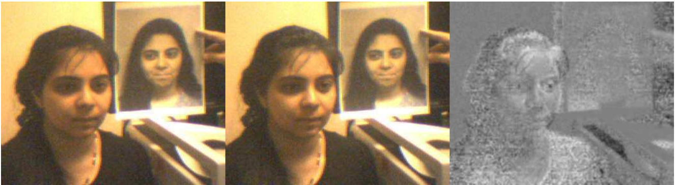
(b) Live face vs. face printed on glossy paper