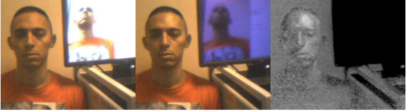
(a) Live face vs. face displayed on an LCD