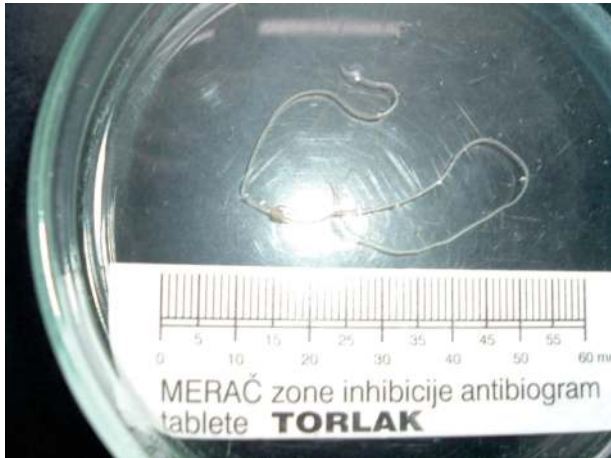
Figure 2. Dimensions of Ascaris lumbricoides

Eggs enter by contaminated food and water into the small intestine, and get through mucosa into bloodstream. Worm infections are followed by aberrant migrations of larva in different intraocular and periorbital tissues. Ocular manifestations are: swelling and redness of the eyelids, subconjunctival nodes, conjunctivitis, larva in tear ducts, uveitis, secondary glaucoma, lens luxation, vitreous hemorrhage, inflammation of the choroid and retina, optic nerve head swelling and pseudo tumor of the orbit. Clinical manifestations may be asymptomatic, depending on the stage of the infection, and the immunity of the host and can be manifested through the migratory phase, respiratory and digestive disorders, allergic reactions, eosinophilia, asthma and urticaria (2, 3).