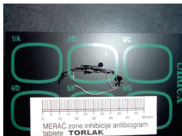
Figure 1. The morphology of Ascaris lumbricoides

The first subset of the alimentary tract of nematodes is the group of Ascaridae — Ascaris lumbricoides , causing Ascariasis. Morphology: a parasite, whitish color, cylindrical shape, with a transverse line on cuticular surface (Figure 1).