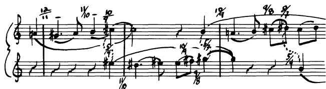
Fig. 1. Excerpt from Lou Harrison's Simfony in Free Style .

Figure 1 illustrates an example from Harrison's Simfony in Free Style , "a rising and 'expanding' sequence."