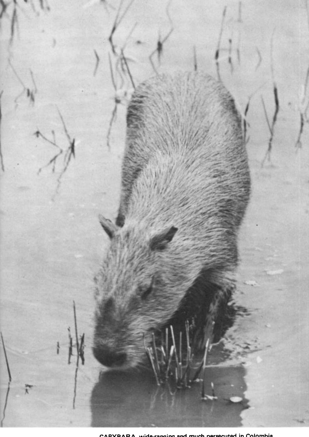
CAPYBARA, wide-ranging and much persecuted in Colombia