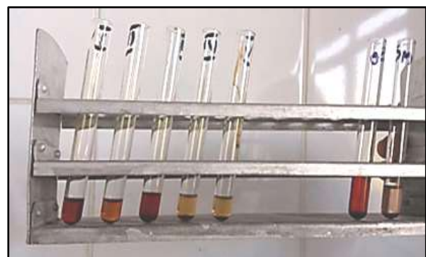
Figure 2. Representation of the Ham test in the workup of PNH.

sucrose tests, and a positive test for hemosiderinuria (the main blood tests results are reported in Table 1). The final diagnosis of PNH was established before any blood transfusions, based on peripheral blood immunophenotyping by flow-cytometry. The flow-cytometric analysis showed a dominant PNH clone within the granulocytes (98% type II), monocytes (98% type II) and a minor PNH clone in the red blood cells (7.9% type II and 0.8% type III, decreased expression of CD59). Concomitantly, the patient was diagnosed with hepatitis C and blood tests indicated signs of autoimmunity (positive rheumatoid factor and positive antinuclear antibodies).