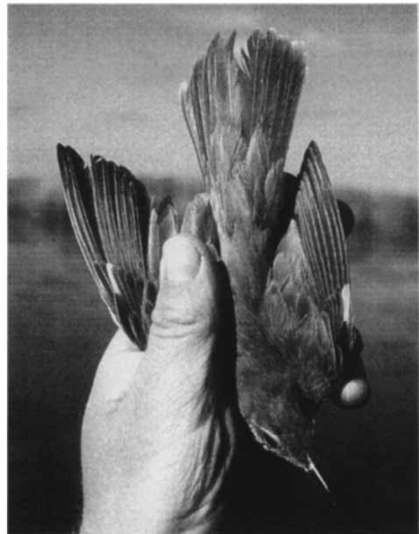
Fig. 1. Female great reed warbler showing partial albinism (individual V-14 in Table 1).

All five birds encountered with albinistic feathers entered the local population during the 1980ies (Fig. 2), however two lived up to 1990 (Table 1). This distribution is significantly different from the null