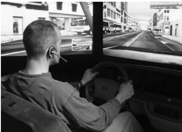
Figure 2. Participant talking on a cell phone in the I-Sim driving simulator.

To determine who initiated the reference to traffic, we analyzed the number of initializations made in the cell phone conversation