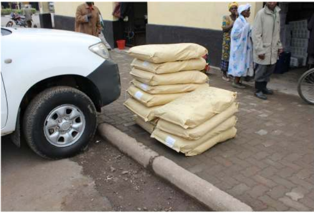
Fig. 7 Bulk deliveries of mancozeb at a chemical supply store in Musanze, Rwanda

Other developments in predictive systems have spurred prediction at a larger scale (Yuen and Mila 2015). Despite these improvements, the adoption of such predictive systems remains modest. One aspect is that the costs of the two types of errors that could be made with a system are unbalanced (Yuen and Hughes 2002). A false-positive (an un-needed fungicide application) has a relatively modest cost, compared to that of a false negative (missing a necessary spray could translate into the loss of an entire crop). Understanding how growers and decision-makers weigh the costs and risks of predictive systems could lead to better implementations of these systems.