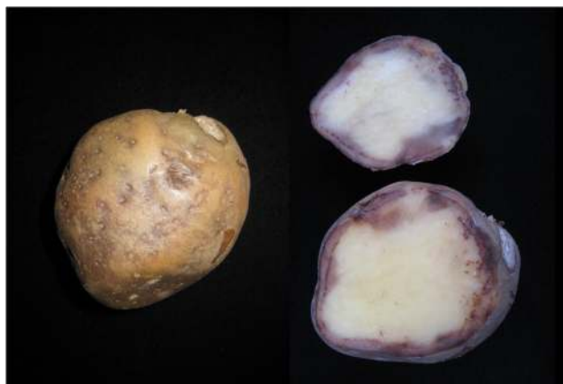
Fig. 3 Symptoms of tuber blight caused by by Phytophthora infestans

using epidemics of late blight in tomato plantings, which often needed assistance through overhead irrigation, as well as borders to prevent spores from moving between the different tomato cultivars. It was in Taiwan that I also realized the importance of proper diagnosis of a disease, after encountering recommendations to use fungicides specific for oomycetes like Phytophthora infestans , against what was clearly powdery mildew (which is caused instead by Leveillula taurica ) on the tomato plants.