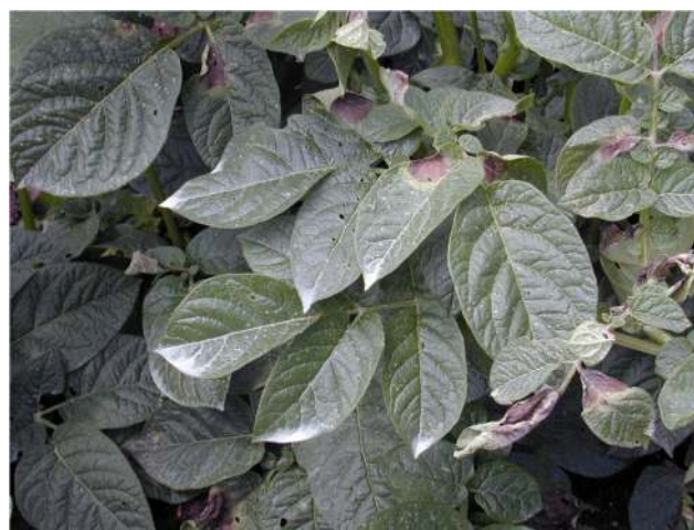
Fig. 6 Residues of mancozeb on infected leaves of potato

Some of the earliest systems for predicting the need of fungicide applications for control of plant diseases were for potato late blight (Beaumont 1947). While the early ones were simple rules using information on duration of certain temperature limits, and a similar measure for some sort of measure of humidity or leaf wetness, these systems have increased in complexity in order to reduce errors that might come about in making predictions for a single field (Bruhn and Fry 1981).