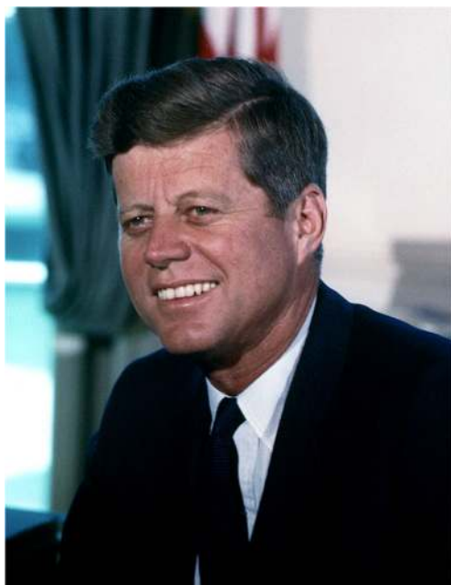
Fig. 5 John F. Kennedy, the 35th president of the US and descendent of immigrants escaping the potato late blight famine in Ireland

potato) was caused by a malfunction in the physiology of the plant. Repeated vegetative reproduction of the potato plant would also lead to some sort of physiological malfunctioning. While sporulation could be seen on these diseased potato plants, it was assumed that this was only a natural course of nature, since dead and decaying matter often had moulds that assisted in their decomposition.