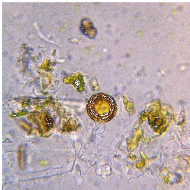
Fig. 4 Oospore of Phytophthora infestans

After the first years at AVRDC I was a post-doctoral scholar at the Swedish University of Agricultural Sciences (SLU) in Uppsala and was also looking into using plant disease epidemics of late blight to try and assess the levels of resistance in different potato cultivars. At the same time, there was interest in using simulation models of late blight, which had been developed at Cornell (Bruhn and Fry 1981). Coincidentally, the development of these models had started