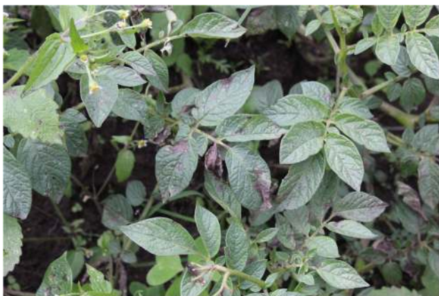
Fig. 1 Foliar symptoms of potato late blight, caused by Phytophthora infestans

my private garden plot, where we had planted potatoes, where I first met the pathogen on a personal basis. I can still remember the combination of the fascination that almost all plant pathologists have when they encounter a disease in real life, as well as the horror that struck me, since I knew that these potatoes were destined for a very untimely ending. The water-soaked lesions on the leaves were quite evident, and I could see the white spore masses that I knew would soon spread to the uninfected parts of the plants. My professional encounters with P. infestans had not yet started, but it was impossible not to be aware of the current research on the pathogen (much of it taking place at Cornell at that time) as well as the historical role it had played with regard to plant pathology and food security.