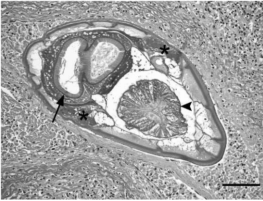
Figure 3. Cross-section of a true strongyle ( Oesophagostomum sp.) within a mesenteric granuloma from a chimpanzee (Ch-016). Characteristic features evident in this section include low lateral chords (asterisks), triradiate esophagus (arrowhead), and large intestine with prominent brush border (arrow). Bar = 100 \mu m.

bly Oesophagostomum stephanostomum , because the buccal cavity was wider anteriorly than posteriorly with 6 denticles projecting into the lumen of the esophageal funnel. In general, parasitic granulomas were more numerous in older chimpanzees, and all but one individual with numerous parasitic granulomas (Ch-045) was in thin body condition.