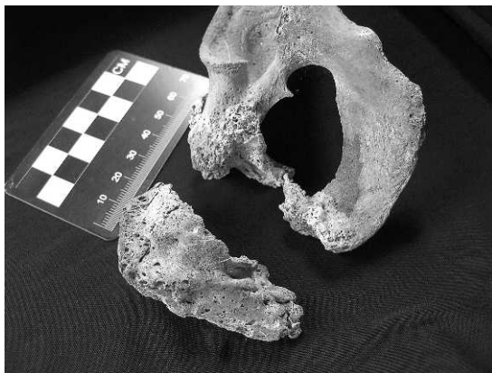
Figure 1. Prepared skeletal remains of a chronic nonunion fracture of the ischium (chimpanzee Ch-045).

gyloidea, Chabertiidae, Oesophagostominae) based on the presence of a small, anteriorly-directed buccal capsule with internal and external corona radiata, copulatory bursa in the males, strongyle-type eggs in the uterus, and ventral groove and cephalic inflation posterior to the buccal cavity. The worms were identified as Oesophagostomum , subgenus Conoweberia , proba-