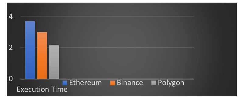
Fig. 4 Chart for processing time