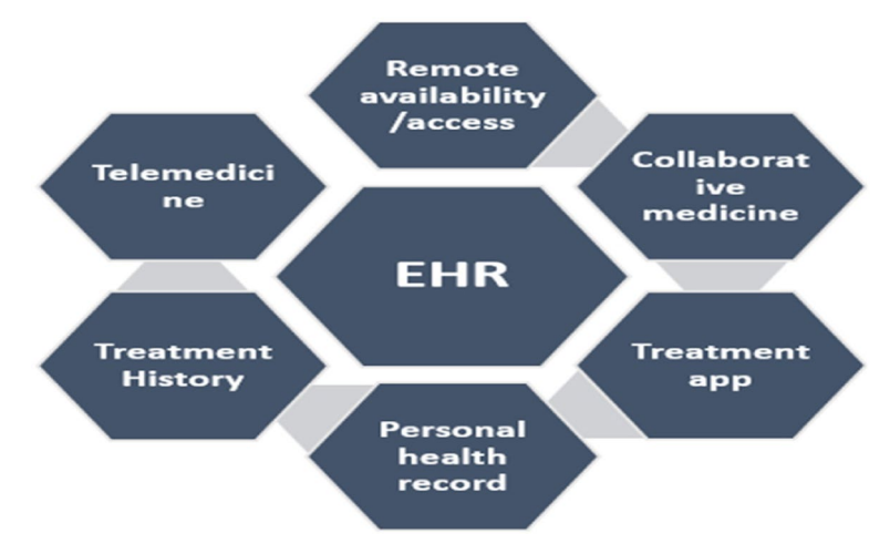
Fig. 1 Electronic health record illustration

Even though it contains individual treatment and medical records, an EHR system is intended to extend beyond the conventional clinical information recorded in a company's office and can encompass a wider view of a child's treatment. Each patient's EHR may include important data, such as a summary of their general health, administrative data, and legal papers.