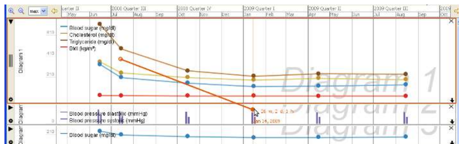
Fig. 2. The first diagram combines several variables. The second and third diagram are resized. The measure tool is shown (slanted orange line) going from the first to the second diagram.

Pan and Zoom : Both were found to be interesting under certain conditions, especially when there were many data items with changing values. However, it must be mentioned that in many cases the line plots in combination with a table showing the concrete values can provide enough information to get a clear overview.