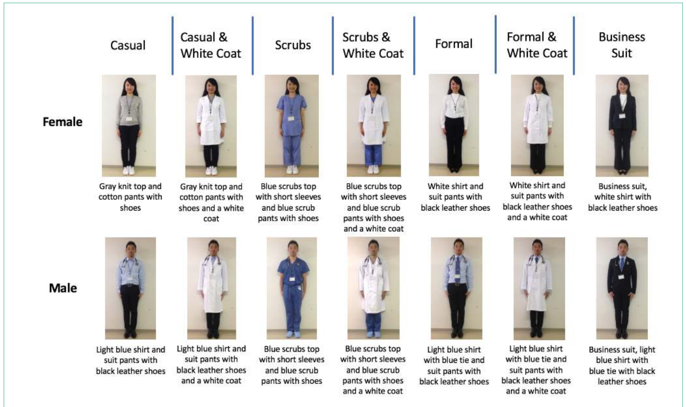
FIG 1. Photographs of Physician Attire