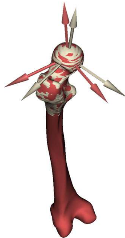
Fig. 1 Variation in femoral reference systems representing the neutral stance position. Reference system in brown colour is generated by employing anatomical landmarks in the proximal femur while the one in red colour is based on the anatomical landmarks in the estimated full femur (Color figure online)

In total, four FE models were developed for each patient to investigate the role of meshing technique and femur orientation method in determining hip fracture risk: model I :