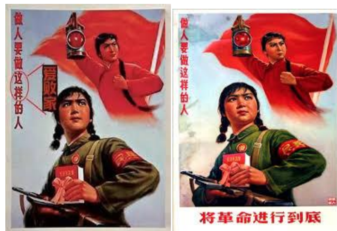
Figures 7 & 8

The second pair of posters in Figures 7 and 8 feature a young woman in militia uniform standing in front of a stage photo from The Legend of the Red Lantern , one of the eight model plays that constituted the official repertoire during the Cultural Revolution. This modernized Peking Opera tells the story of how Li Tiemei, whose parents sacrificed their lives in the underground struggle against Japanese invasion, became a revolutionary following in the footsteps of her parents. On the original poster, the caption on the left says ‘I shall aspire to become someone like that’, which was Tiemei’s line in the play after she heard the stories of her parents. At the bottom it says ‘carrying out the revolution until the very end.’ The parody eliminates the message at the bottom of the picture and changed the caption to ‘I shall aspire to become an extravagant woman.’ A reconstruction of desire (Rofel 2007) is manifest in this pair of posters.