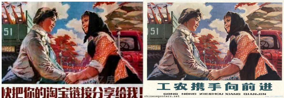
Figures 9 & 10

background. In the spoof the original slogan ‘workers and peasants marching forward hand in hand’ is changed to ‘share your Taobao 3 link with me now!’