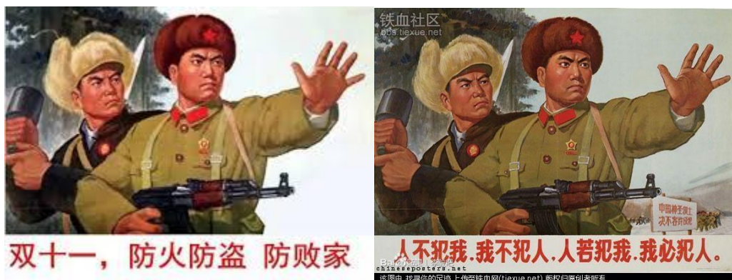
Figures 5 & 6

occupy most of the picture. They both appear to express outrage and vigilance, and to be staring down at the enemies in front of them. The man at the back is holding a grenade, while the one at the front has his right hand on the trigger of a rifle and his left hand is forming a stop sign toward the enemy. They are standing on snow-covered ground with the silhouettes of pine trees as a backdrop — clear references to the setting in which the Korean War took place. In the original poster, there are more soldiers at the background and a large bulletin board saying ‘no invasion would be allowed into the sacred land of China.’ These are removed in the parody. At the bottom of the picture, the original caption says: ‘we will not attack unless we are attacked, if we are attacked, we will certainly counterattack.’ This is changed in the new version to ‘Double Eleven, stay vigilant against fire, theft and spendthrifts.’ While the masculine figures in the original poster are poised to protect the motherland from imperialist intruders, in the spoof the men take on the task of defending their savings and property against shopaholic women. A patriarchal tone underpins the juxtaposition. While the original socialist poster features the heroic sons protecting the motherland from imperialist intruders, in the spoof, the men take on the task of defending their hard earned assets against shopaholic women.