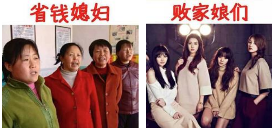
Figures 2 & 3

This message is driven home by a neon box (figure 4) advertisement from Tmall.com which appeared in the Shanghai subway at the beginning of 2016. Tmall is an online retail platform operated by Alibaba that sells brand name goods to middle-class Chinese consumers and has been a major beneficiary of the Double Eleven shopping frenzy. The advert features a curvy female figure wearing a red Qipao , the traditional Chinese dress that is now usually seen at wedding or other festive occasions. The woman's face is largely cut off with only the bright red lips left visible. The advertisement incorporates signs that connote conventional Chinese beauty, while using the strategy of close cropping that objectifies part of the female body (Schroeder and Borgerson 1998). Corresponding to such objectification, the large font text on the right says 'to call a woman a savvy shopper is a far better compliment than to say she is a capable earner. Visiting Tmall is the right choice'.